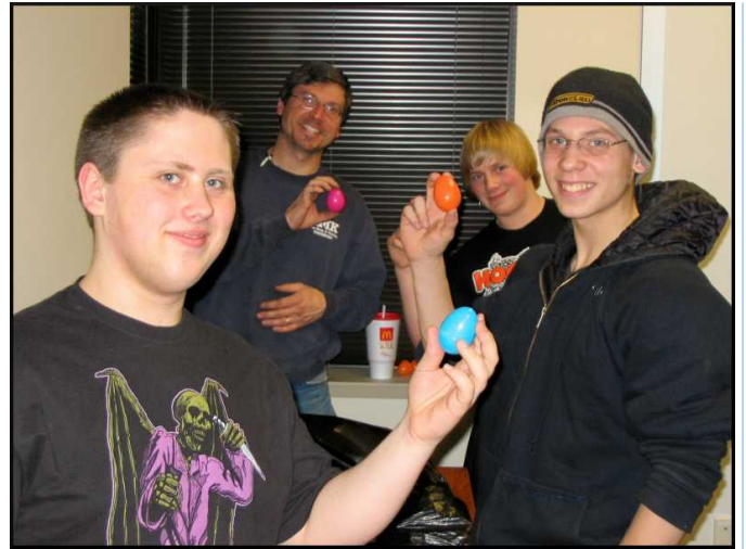
Top Left: Easter Egg stuffing at March Lions Club Meeting.